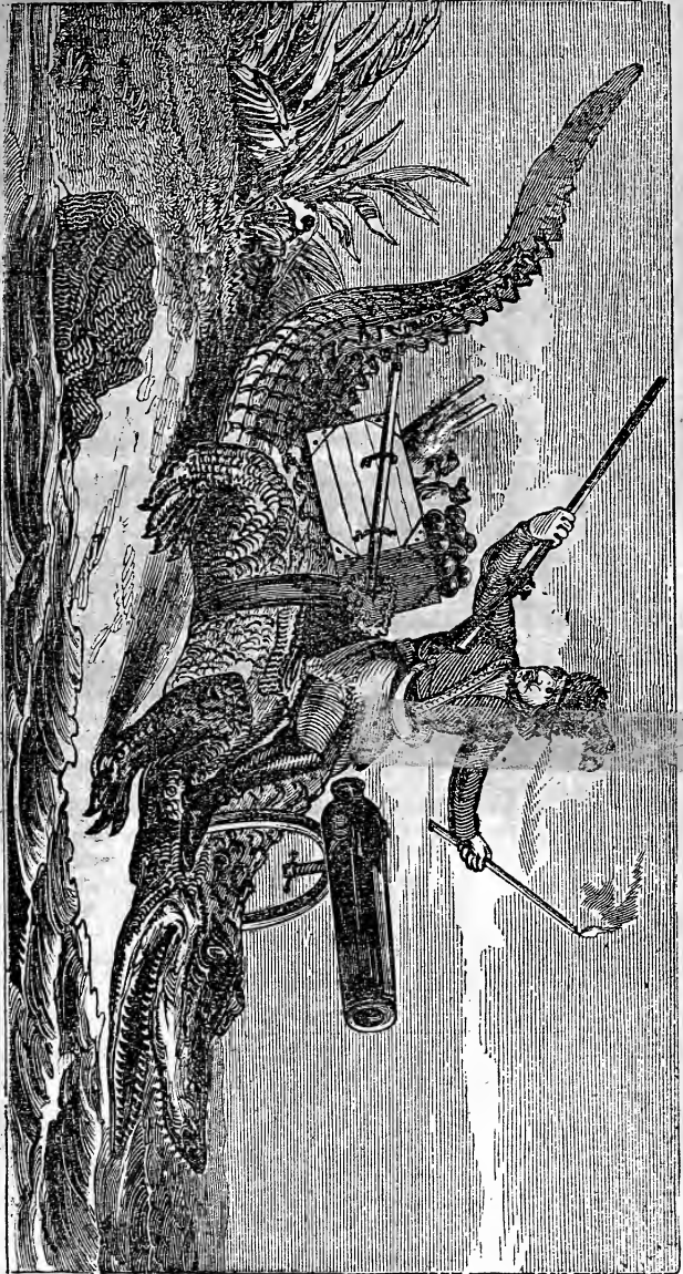
CROCKETT DEFENDING THE MOUTH OF THE MISSISSIPPI.